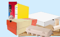
Cardboard and boxboard