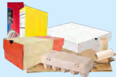
Cardboard and boxboard