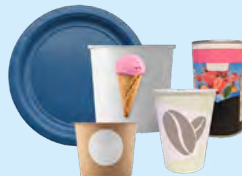
Paper laminate packaging